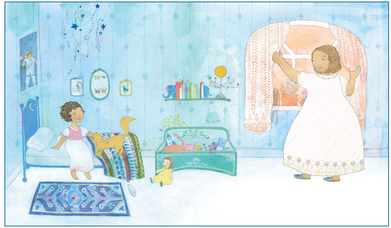
planet missing from solar system, belt missing from grandmother's dress. Answers: Star missing from headboard, Mina's nightgown color, picture frames moved, butterfly missing from center frame, cat color, slipper missing, dots missing from ball,